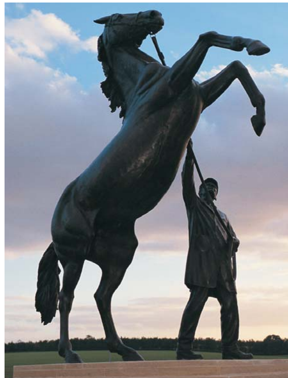
Newmarket Stallion Bronze Statue (nr. entrance of The National Stud)

This cycle ride starts from the horseracing capital of the world, Newmarket. From here the route heads north west to the 'Fen edge' villages of Burwell, Reach and Swaffham Prior. These former inland ports date back to Roman times, with their ancient waterways or 'lodes'. In complete contrast, the return journey takes you into a rolling patchwork of chalk grasslands, paddocks and woodland, home to lavish stud farms. Here you can explore villages with thatched and colour-washed cottages. Along this route you can discover the 'tragic tale of the flaming heart', visit a 15th C. Packhorse Bridge and take a stroll along the Roman road - The Devil's Dyke.