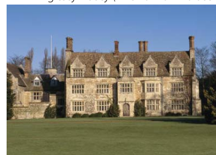
Anglesey Abbey (nr. Swaffham Bulbeck)