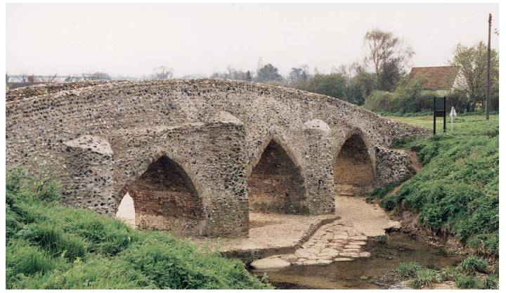
Packhorse Bridge, Moulton

20 At the X-roads with the B1061, go SA onto Stetchworth Road, SP 'Stetchworth 1, Woodditton 2 1/2'. ⚠